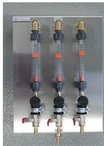
3-WAY MULTIPLE DISTRIBUTOR

3-way distributor with 6 x 1/2" ball valves and a flow indicator per water return. A regulating valve for volume flow regulation is also installed per water supply. Designed for external wall mounting, it can be placed anywhere. The distributor is mounted on a wall bracket and can be attached to various locations from the outside. Wall brackets are possible with up to 12 forwards and 12 returns.