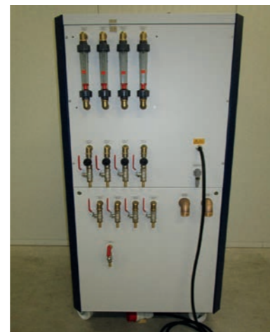
Laboratory cooler with multiple distributors on the device