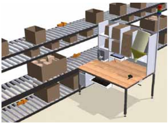
Carton Packaging System

for research and development also considered. Complementary to the system solutions and exhibits presented, further new developments that are manufacturer-independent can be planned, introduced and implemented as working models (like robotic cells).