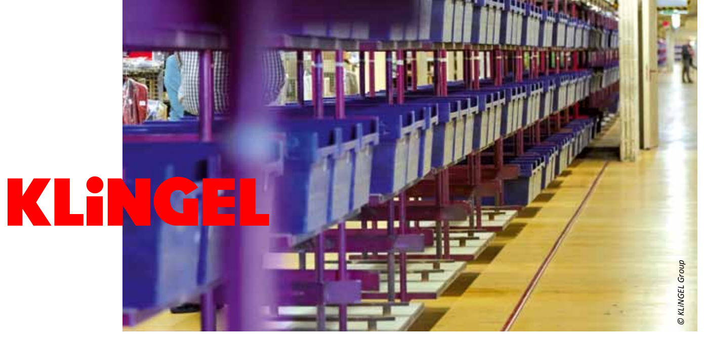
The commissioning of the circular conveyor at KLiNGEL was in 1979.