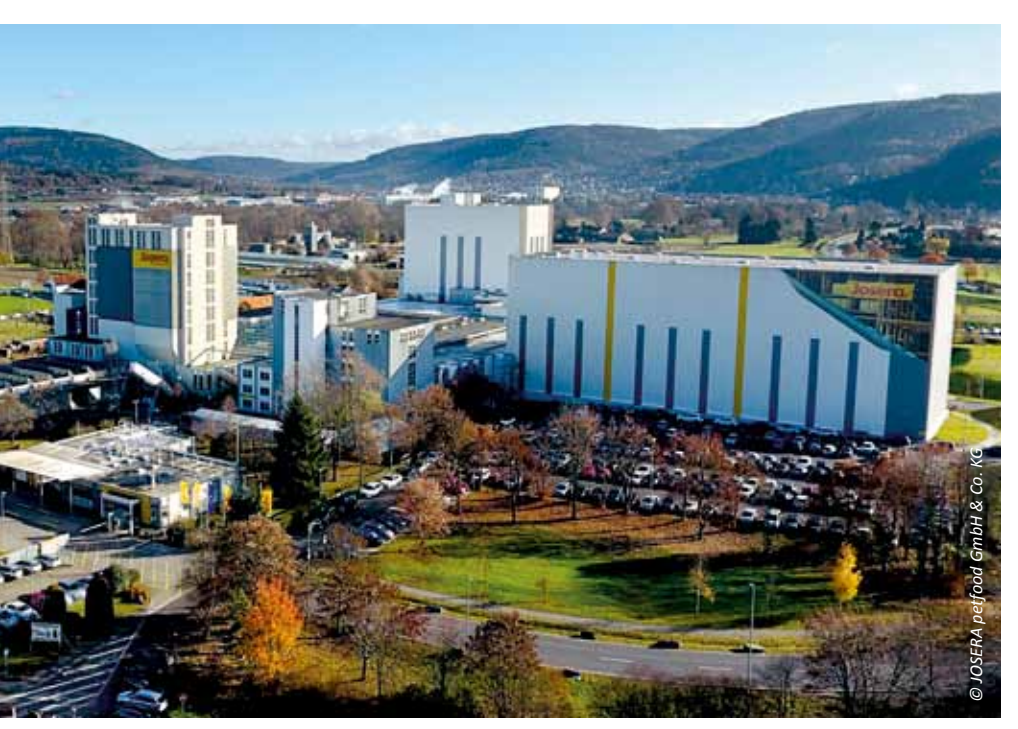
For almost 40 years, the JOSERA company complex in the industrial area of Kleinheubach/Bavaria has steadily grown to its present size.