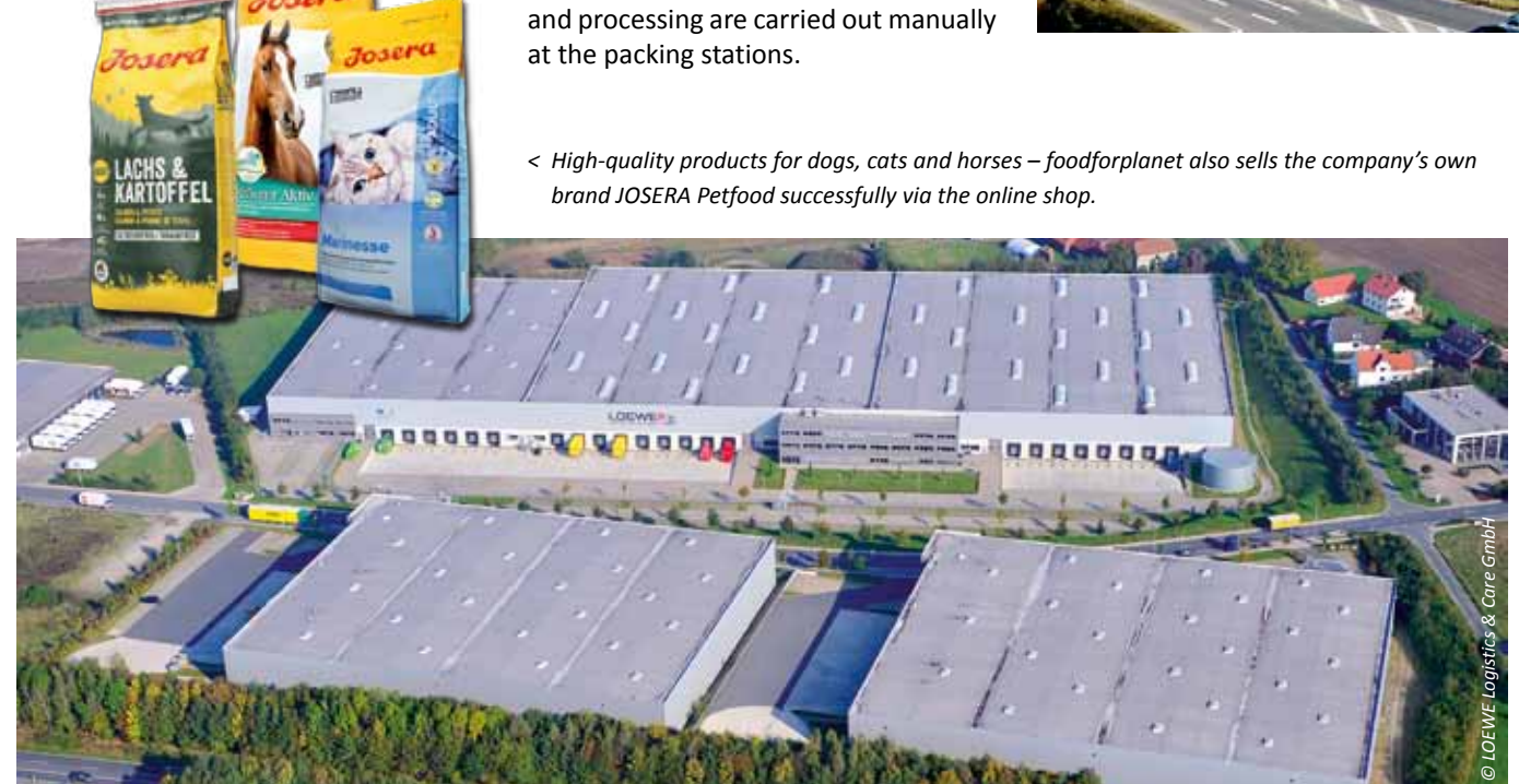
Individual solutions for distribution logistics and fulfillment – the service provider LOEWE Logistics & Care offers its customers around 30,000 m<sup>2</sup> of storage space in Herford.