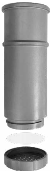
Sample Holder Q-Cup

The EDGE is a sequential automated pressurized fluid extraction system that is faster than Soxhlet and simpler than other automated extraction systems. With the Q-Cup® Sample Holder, it is perfect for efficiently preparing samples for US EPA 3545A. The EDGE automates the extraction and washing process and provides a filtered and cooled extract.