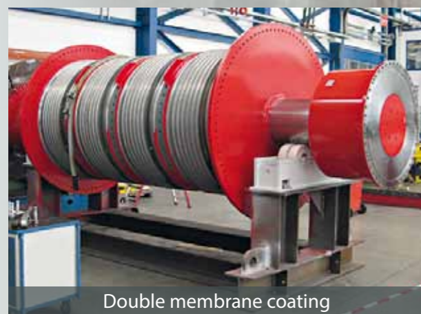
Double membrane coating