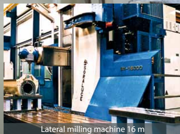
Lateral milling machine 16 m