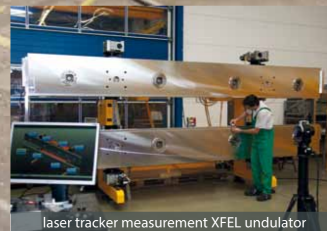
laser tracker measurement XFEL undulator