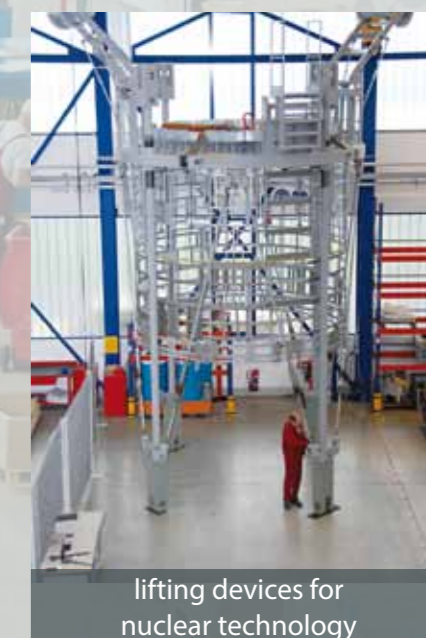
lifting devices for nuclear technology