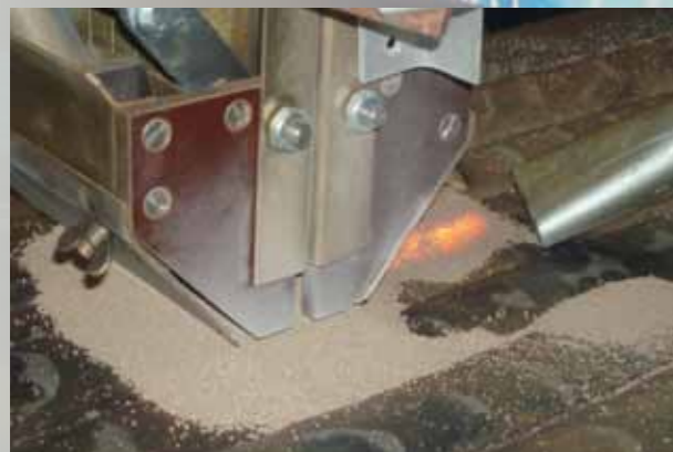
Submerged arc welding