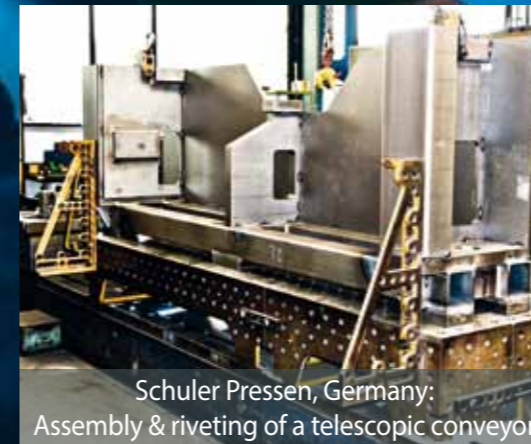
Schuler Pressen, Germany: Assembly & riveting of a telescopic conveyor

The current certificates can also be found at: http://www.kinkele.de/zertifikate.html