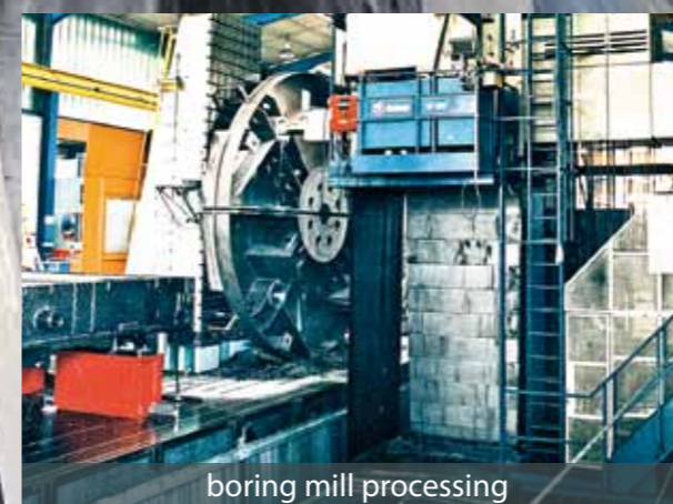
boring mill processing